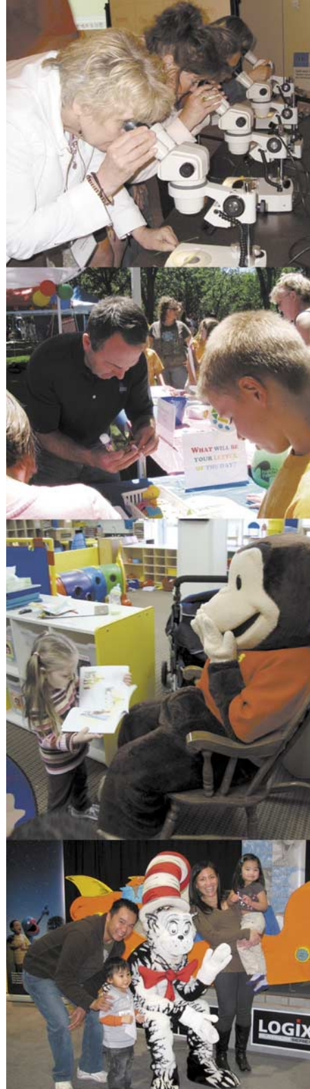
Photos top to bottom: Teachers at Prairie Public's Teacher Training Institute; learning through play at Midwest Kid Fest; reading to Curious George; The Cat in the Hat and some fans at the Winnipeg Baby and Kids Show.

With Prairie Public's educational activities, television and radio programming, video-on-demand, and the web, students young and old are finding a world of valuable learning.