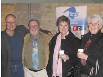
Photos top to bottom: North Dakota Forest Service staff and Prairie Public staff and members plant trees to celebrate radio's spring membership drive; recording narratives for the Library of Congress when Storycorps came to North Dakota; friends gather before comedian Paula Poundstone's performance.